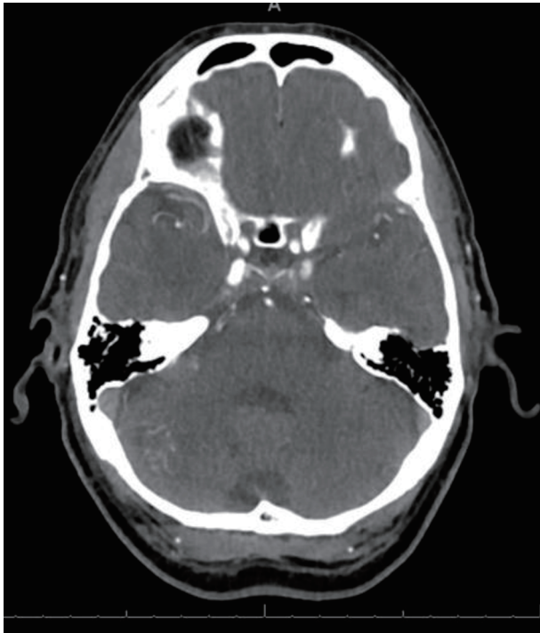
Figure 3. Follow-up axial CTA demonstrating stable serpiginous vessels in the inferolateral aspect of the right cerebellum. CTA: computed tomography angiography; pAVF: pial arteriovenous fistula.

more pial arteries feed directly into a cortical vein without any intervening nidus. It can sometimes be difficult to differentiate them from micro-AVMs which are AVMs whose nidus is smaller than or equal to 1 cm. In general, micro-AVMs are visible on angiography but in some cases only abnormal arterial blood supply or abnormal venous drainage can be found [8]. In these cases, it can be challenging to differentiate micro-AVMs from pAVFs.