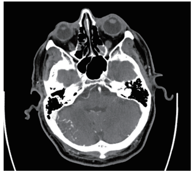
Figure 1. Axial CTA demonstrating serpiginous vessels in the infero-lateral aspect of the right cerebellum. CTA: computed tomography angiography.

The patient was back to his clinical baseline after several days and delayed follow-up CTA demonstrated stable findings (Fig. 3). To date, more than a year from his initial diagnosis, the patient did not experience any hemorrhagic complications and his